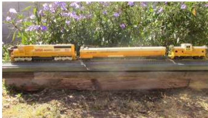
Model NASA LH2 delivery train. (Addison Bain)

Native mesquite, palo verde and date palms from seed for future Maricopa oasis.