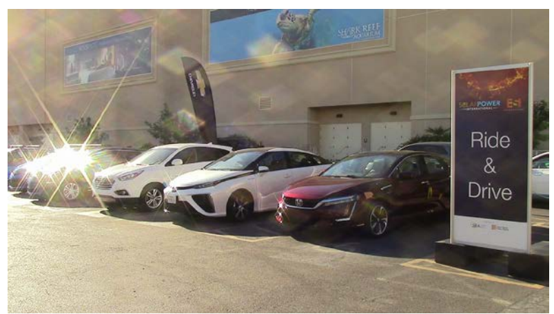
Hyundai Tucson, Toyota Mirai and Honda Clarity Ready for Test Drives

The first <u>Hydrogen + Fuel Cells North America</u> exhibition made up part of the Solar Power International Conference, September 10-13<sup>th</sup>, 2017 in Las Vegas, Nevada. Hydrogen + Fuel Cell shows have been held in Hannover, Germany since 1995. Vendors from 30 international companies liked nothing better than to talk about their hydrogen products. Everyone who wanted to could drive a fuel cell Hyundai, Toyota or Honda around the block. I couldn't help hoping there were no fuel leaks as I pushed the button to start the Honda Clarity. Otherwise, it was designed to drive like a very ordinary car.