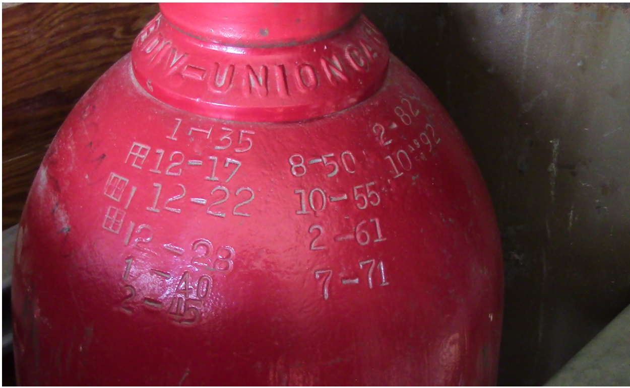
AHA steel gaseous hydrogen cylinder has been in use since 1917. Made by Union Carbide