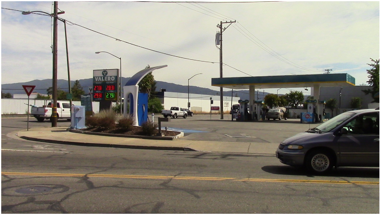
First Element hydrogen station in Campbell, CA