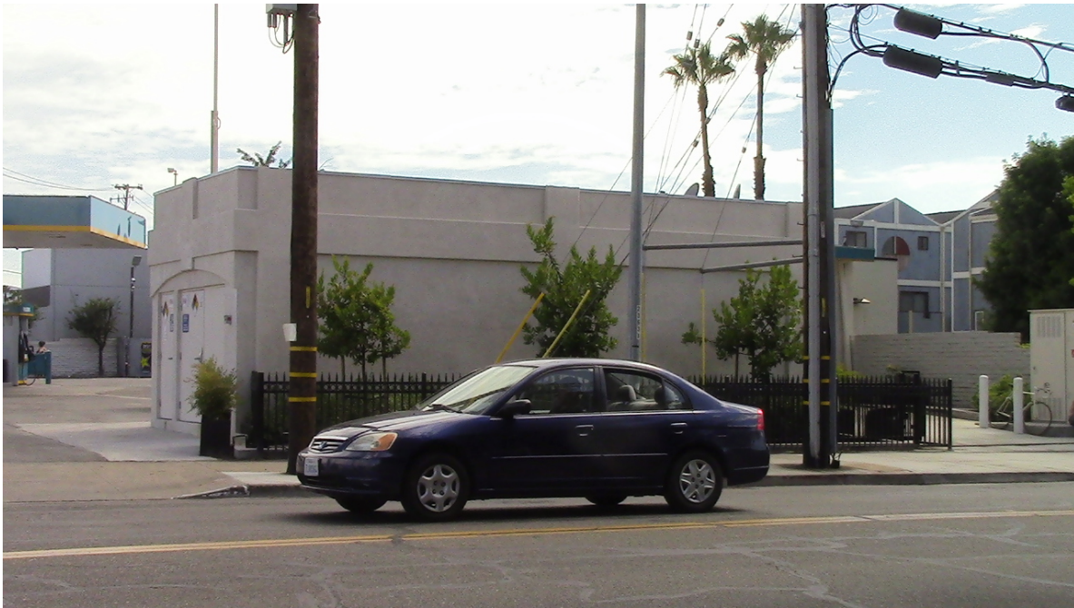
Fully Enclosed Hydrogen Storage in Campbell

Whenever Phoenix gets a hydrogen station, we should be able to drive all the way to San Francisco in any 300-mile-range hydrogen car. Europeans can already drive hydrogen vehicles along many major highways from one end of Europe to the other.