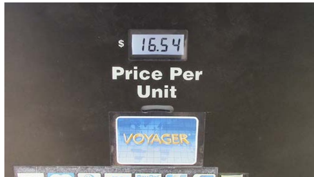
Price of hydrogen per kilogram

. Hydrogen is supplied from a liquid hydrogen tank at the back of the lot. The price per kilogram was $16.54, equivalent to a gallon of gasoline. That sounds unreasonably expensive, but consider that a fuel cell car gets twice the MPG of a gasoline engine and think about what it's costing us to breathe car exhaust every day.