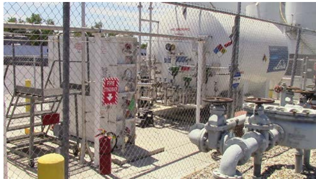
West Sacramento liquid hydrogen (LH2) storage