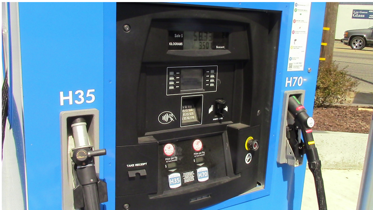
350 bar (3000 PSI) Hydrogen or 700 bar (7000PSI) Hydrogen