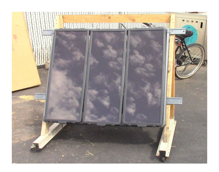
Three 15 Watt Solar Panels

By itself the kit can recharge your dead car battery, but to be useful beyond that we added a HF #68680 35 Amp hour battery ($69.99). This will store the electricity to run the CFL lamps at night. The two bulbs supplied are 12 volt, not easy to find locally. A better idea is to use a HF #69660 750 Watt inverter ($37.99) and purchase some 120 volt power-miser LED bulbs. The inverter will also power a laptop, electric drill or TV. Don't expect it to run a refrigerator or the microwave. The charger does have a 5V USB port for keeping phones and cameras charged. There is also a handy digital LED voltage meter. This light duty kit would be suitable for a small RV, portable or backup applications.