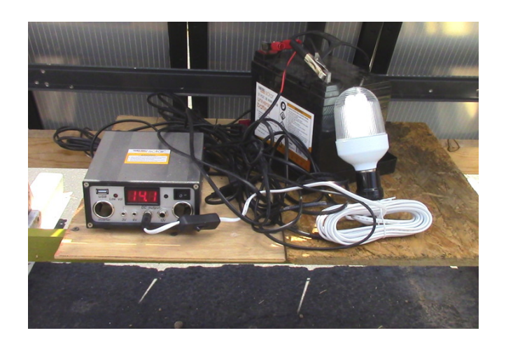
Charger, Battery and CFL Lamp