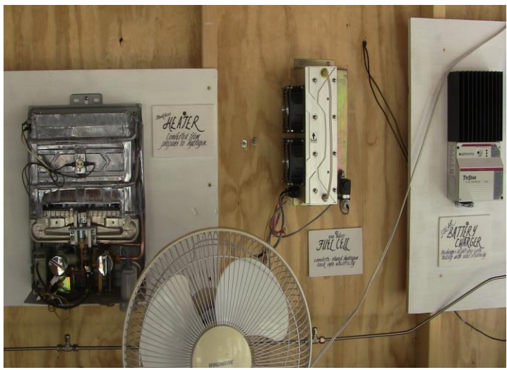
H2 water heater and fuel cell