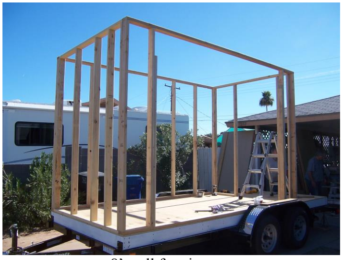
8' wall framing.