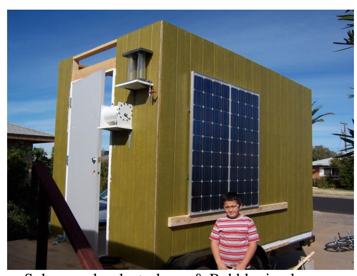
Solar panels, electrolyzer & Bubbler in place