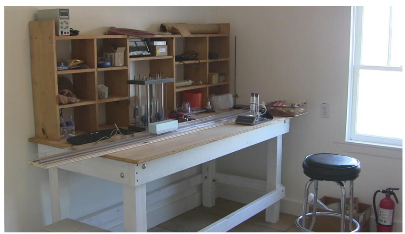
AHA HQ Lab Bench