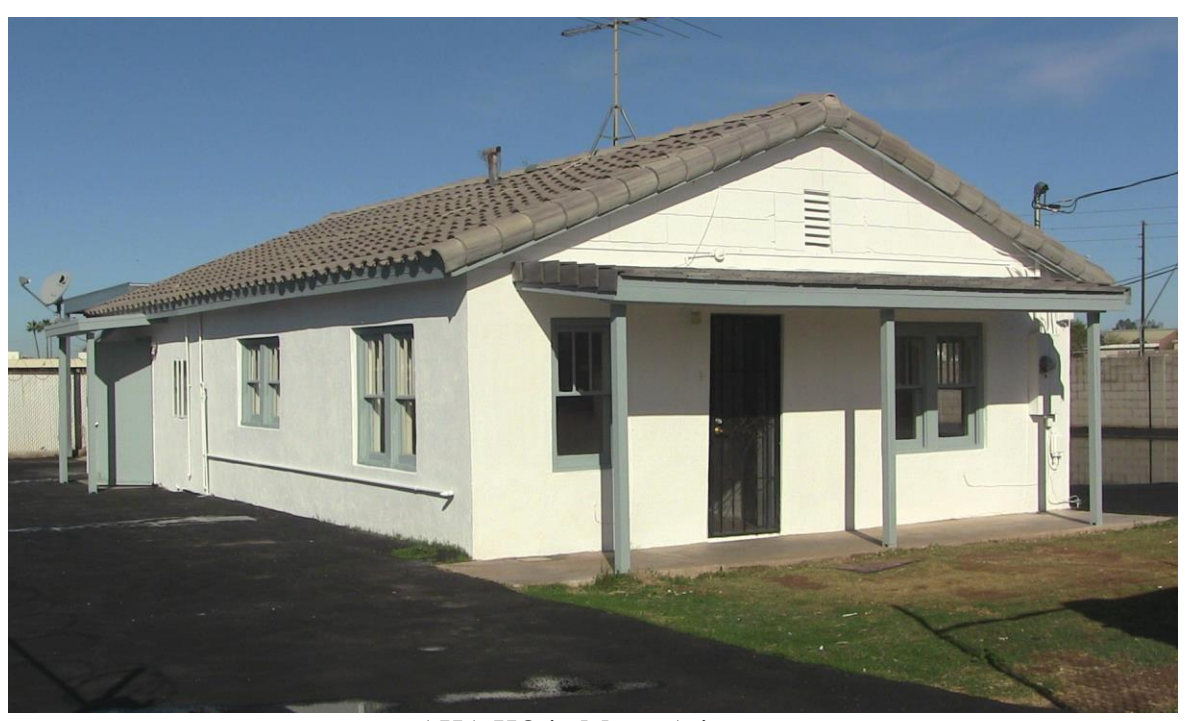
AHA HQ in Mesa, Arizona