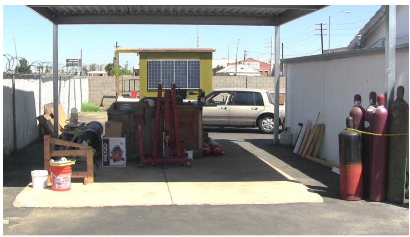
AHA HQ Covered Working Pad