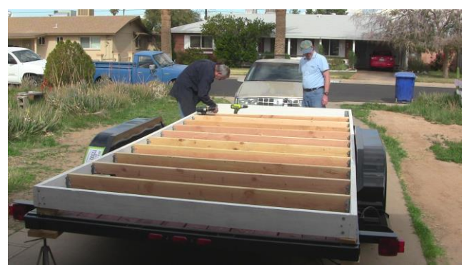
Claude & Clyde finish the base on trailer

Fuel cell- Horizon FCS-500, 500 Watt, 12V @ 35 amps output, uses 6.5 liters H2/minute maximum, 99.995% purity