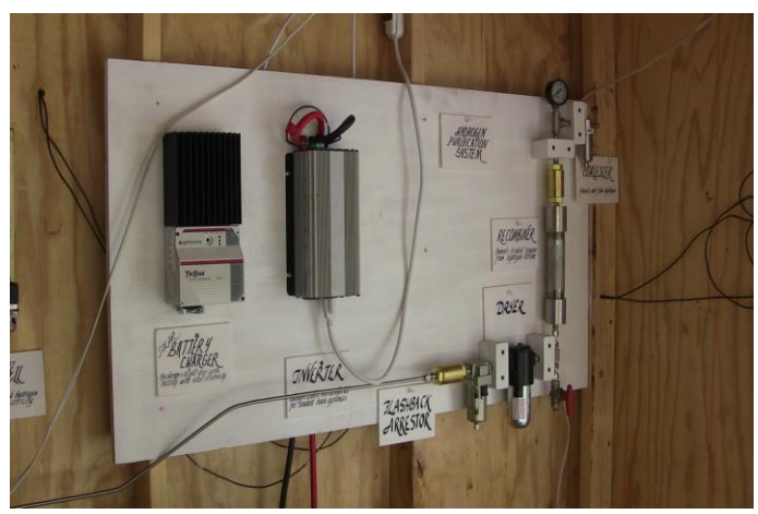
PV electronics and H2 purification system