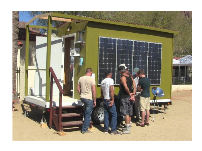
AHA Solar Hydrogen House

From February 15<sup>th</sup> to March 23<sup>rd</sup>, AHA members presented our solar hydrogen house at the MicroDwell 2014 exhibition at Phoenix's Shemer Art Center. Over a dozen entries proved you can live inexpensively and comfortably in less than 600 square feet. Every weekend there were about 2000 visitors who learned how Arizona sunshine can be stored as hydrogen. It was a pleasure to hear all the positive comments. Visitors also told us stories about their hydrogen experiments and research from years ago. The star of our display was the Horizon 500 Watt fuel cell. After being told that fuel cells are years away, people were impressed to see and touch one. One phrase we heard over and over was "off the grid." There is a market for a safe, practical and affordable solar hydrogen energy system. (continued on page 2...)